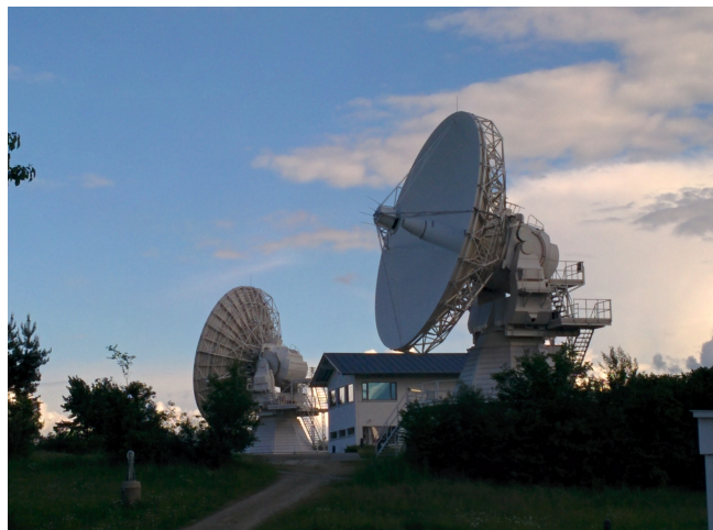
Figure 1: Station Wettzell (Germany) with the new twin radio telescope

Ringlasers represent an elegant and alternative measurement technique. They can measure Earth rotation in an absolute sense, independently of an external reference frame like quasars used by VLBI. However, the demands on such instruments are extremely high and cannot be met by existing com-